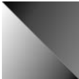
satin iron grey