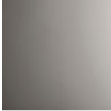
polished stainless steel